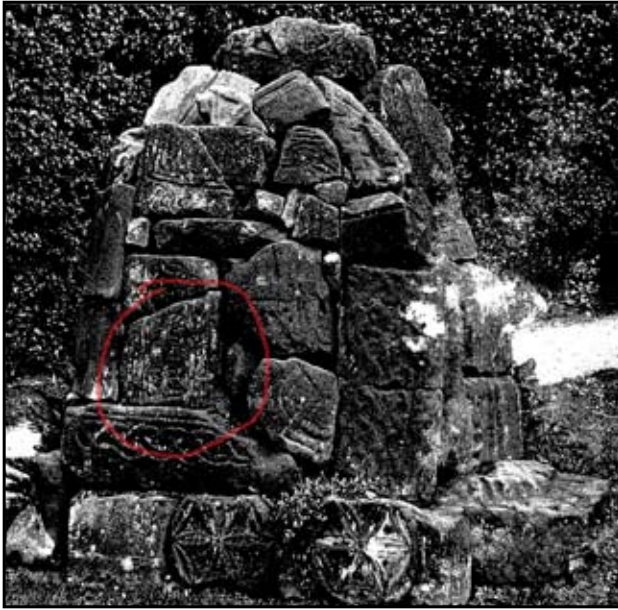
Sandstone fragment highlighted in the 1880s photo

human. The Neolithic date is based upon fragments of locally made carinated bowls (a common type of Neolithic pottery) and flintwork found in some of the features, though this may change once the features have been radiocarbon dated.