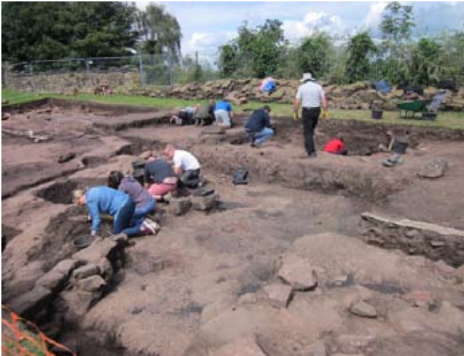
Halton Castle - July 2017

19th April - Annual General Meeting + speaker t.b.a.