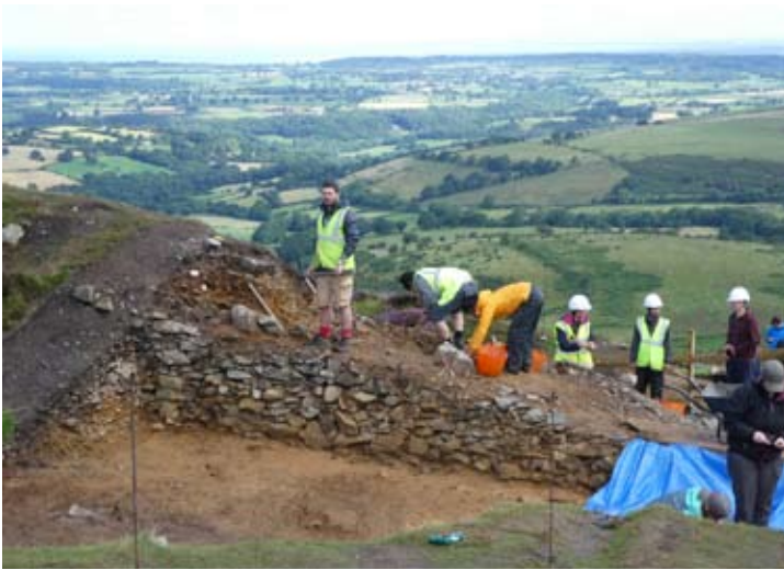
The inner rampart at Penycloddiau

19th century prison modelled on Pentonville - it is now a museum and also houses the County archive. The group also visited Nantclwyd y dre, the oldest timbered town house in Wales, started in 1435 and subsequently extended several times. There are views of the castle and the surrounding landscape from the newly replanted garden.