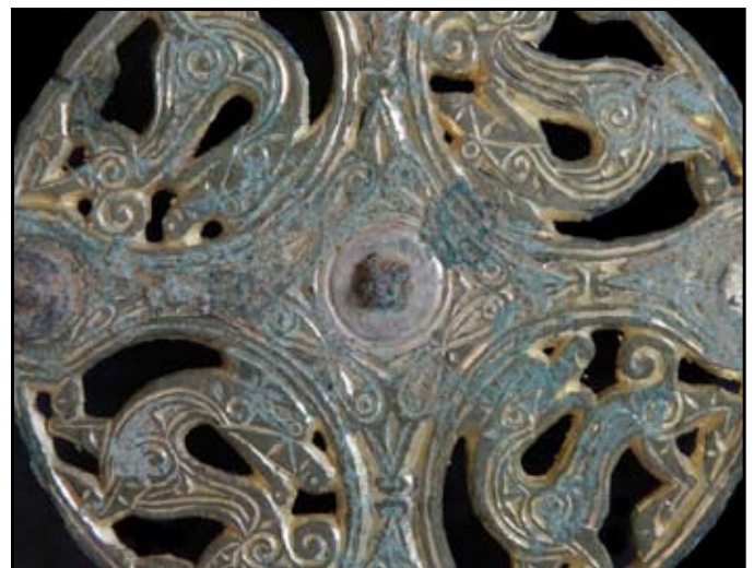
Early Medieval Brooch from Liverpool Museum

have the opportunity to acquire Treasure which has been reported and enhance their collections. Treasure is any object more than 300 years old which is more than 10% gold or silver, for coins it is two or more gold or silver coins found together or 10 or more base metal coins found together, two or more prehistoric objects found together, and any objects which are found in association with Treasure are also classed as Treasure. For example the pieces of lead discovered with the Huxley Hoard and the pottery found with the Knutsford Hoard are Treasure by association. When Treasure is discovered legally the finder has 14 days to report it to the local coroner for the area in which it was found. This can be done through the local Finds Liaison Officer. To celebrate museums around the country are placing Treasure 20 stickers on their displays which have come to the museums through the Treasure Act, to highlight the work of the Act. The introduction of the Treasure Act resulted in the creation of the Portable Antiquities Scheme (PAS).