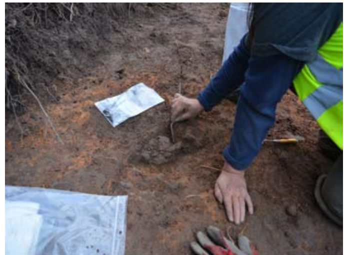
Neolithic pottery being excavated from a small pit

The site lies in the historic core of the village of Bromborough, adjacent to the churchyard of St. Barnabas church which almost certainly pre-dates the Domesday Survey. The medieval church was demolished in 1827/8 after it had become impossible to maintain. Eventually the new church became too small for the rapidly expanding village and was itself demolished and rebuilt on a much larger scale in 1862-4. During the rebuilding fragments of Anglo-Saxon sculpture were recovered from the foundations of the 1820s church and were stored on the lawn of the Rectory until they were lost during reconstruction of the Rectory in the 1930s.