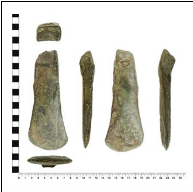
Bronze Age palstave axe

The axehead is of Middle Bronze Age date, probably of the Acton Park or Taunton metalwork assemblage dating from c.1500 to c. 1300BC and has been miscast. The blade of the palstave is worn and uneven with a blunt, convex cutting edge. The rear of the axehead has been damaged or miss-cast so that the septum (the area between the flange facets and the stop ridge) is missing or 'filled in' on one face and complete on the opposite face. On each side of the axehead is a proto-trunnion stop to aid the hafting of the axe, stopping it from moving as much. This suggests that the axe did not have a side loop. The blade is worn, slender and slight and the casting seems have been trimmed and hammered flat. The object has an undulating and pitted surface with a mid-green patina however it has been coated in wax.