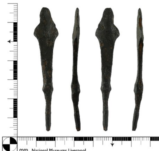
Fig. 2. Complete medieval iron tanged arrowhead dating to the medieval period, c.AD 800-1100.

Finders of chance archaeological finds from England and Wales are able to report their discoveries to their local Finds Liaison Officer (FLO) – their details can be found here: https://finds.org.uk/contacts