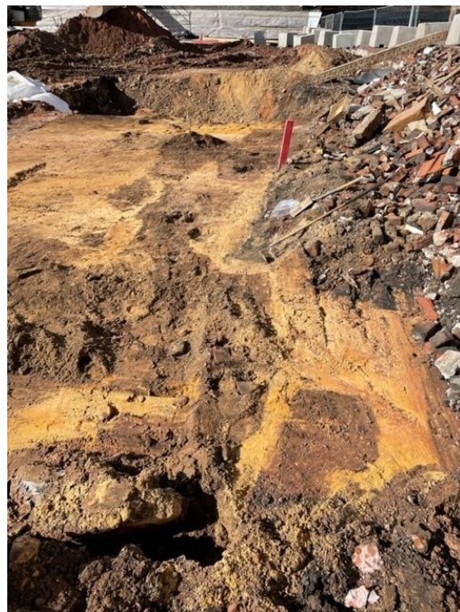
Fig. 2. First grave exposures at Hondo supermarket site, Liverpool

AMS dating of a peat deposit from a site North of Kenyon's Lane, Lydiate, by Oxford Archaeology North placed the peat deposit within the early part of the later Mesolithic, with the pollen analysis providing evidence of probable light disturbance to the woodland canopy, interpreted as likely created through burning, in order to enhance local grazing activity. The new pollen data from this thin peat overlying the Shirdley Hill Sand at Kenyon's Lane therefore contributes further to understanding landscape evolution and probable human impact during the earlier part of the late Mesolithic in this area.