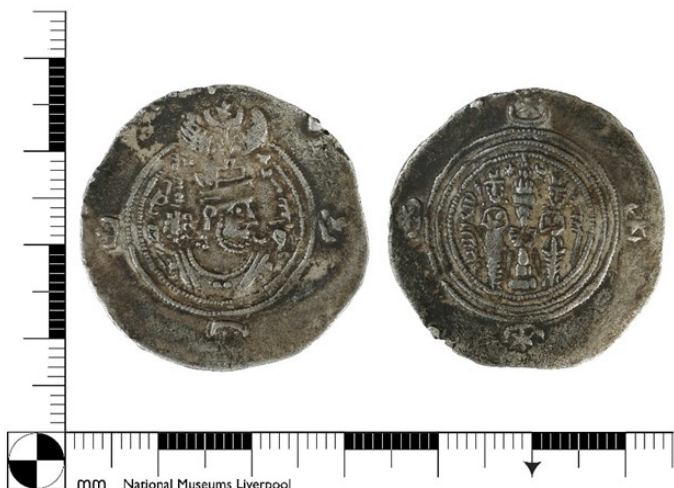
Fig. 1. Sasanian drachm of Khusrau II from Wirral, minted in Shiraz (Iran), dating to c.AD 615-18.

Within the North West, 1,607 objects were recorded in 992 records, of these 100 objects in as many records were reported from Merseyside. Most of these objects are reported from Wirral, largely due to recent metal detecting surveys carried out by Wirral Archaeology CIC. Some of their key 2022 finds include an early medieval silver Sasanian drachm of Khusrau II (LVPL-BED8F3) (Fig. 1) and complete medieval iron arrowhead (LVPL-18B0A6) (Fig. 2).