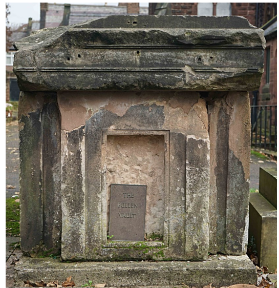
Fig. 4. End view of the Bullen 'mausoleum'. A metal plaque inscribed 'THE BULLEN VAULT' can be seen in the centre. The small holes in the band at the top continue.

The next Newsletter will include an article on the first St. Peter's Church in Woolton.