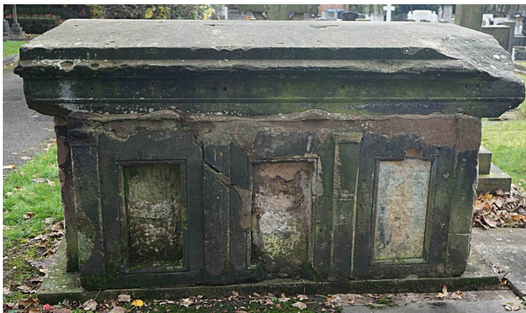
Fig. 3. Front view of the Bullen 'mausoleum'. There is no inscription but the 3 panels may originally have contained plaques. Also note the small holes in the band at the top where plaques may have been attached.

Early work on the building construction site quickly revealed the gravestones which by then had been buried for over one hundred years. About 20 of them were subsequently moved to St Mary's Church and re-erected on the northern perimeter of the churchyard immediately adjacent to the boundary which overlooks a long drop into Woolton Quarry. This area is now overgrown and sealed off from the rest of the churchyard by a security fence. One other headstone and the Bullen 'mausoleum', a large chest-tomb (Figs. 3 & 4), were re-erected in the main churchyard. Permission to access and record the Woolton Priory monuments within St. Mary's and behind the security fence is currently being sought.