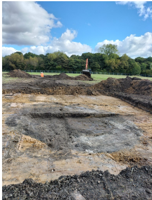
Fig. 1. Exposure of coal shafts at Windy Arbor, Whiston

The year 2022 saw an increase of almost one third against the previous year in archaeological development-led investigations. The majority of these were evaluations (trial trenching or strip and record). Most resulted in archaeology of local importance being recorded but a few are of regional interest.