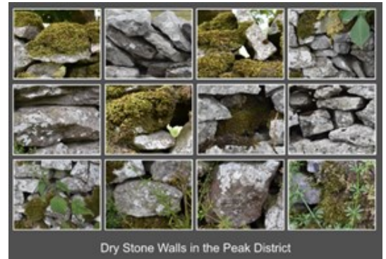
Dry Stone Walls in the Peak District

How can engaging with archaeological landscapes impact both our wellbeing and our sense of identity? This is the main thread of my PhD research and will be discussed in relation to issues such as access, diversity, inclusivity and equality, as well as the way they are affected by the Covid-19 pandemic. One method I am using to highlight these issues is Deconstructed Landscape Photography which looks at individual elements of the landscape, in a panel rather than the landscape as a whole.