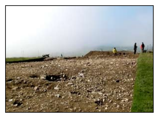
The Meillionydd site with post holes and storage pit in foreground