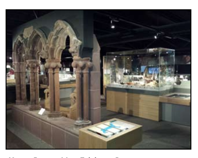
Norton Priory - Main Exhibition Room

Norton Priory has many claims to fame. It is Europe's most excavated monastery. It has the greatest variety of monastic tiles found in Britain. It has the most elaborate cloister of 13th century date. Its statue of St. Christopher is one of the most important surviving examples of medieval sculpture in the country. The site also has 900 years of history. Does the new Museum do justice to Norton Priory's historical importance?