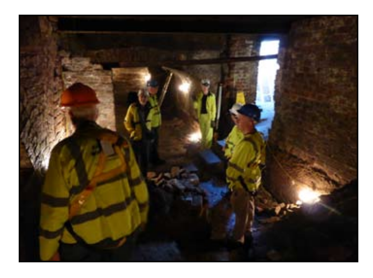
The 'Wine Bins' cellar below Williamson's House